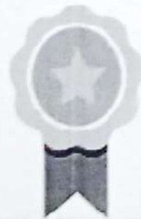
Secretary & Correspondent