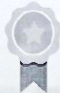
Secretary & Correspondent

MNR Dental College & Hospital MNR Nagar, Narsapur Road, SANGAREDDY DIST-502294 T.S.