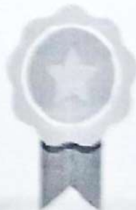
Secretary & Correspondent