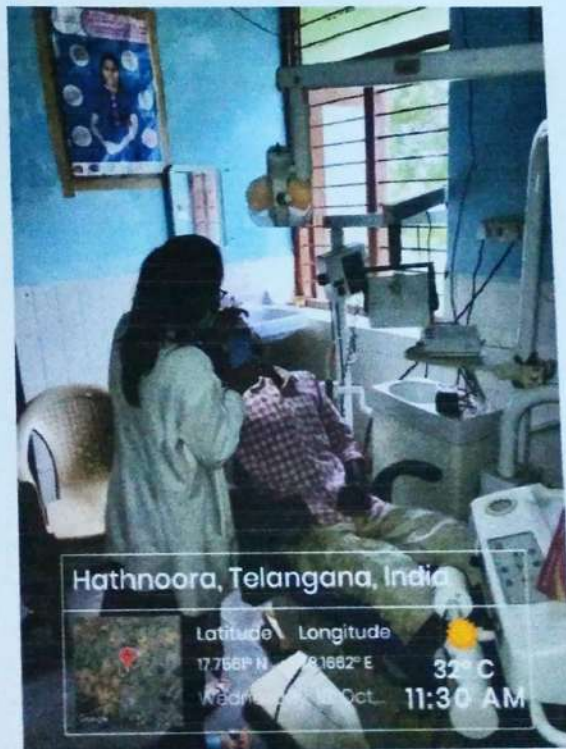
Hathnoora, Telangana, India

Latitude Longitude Temperature 17.7581° N 78.1682° E 32° C Wednesday, 18 Oct. 11:30 AM