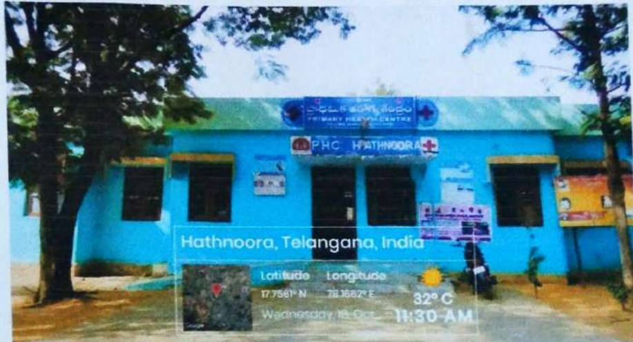
Hathnoora, Telangana, India

MNR Nagar, Narsapur Road, Fasalwadi, Sangareddy 502294, Telangana State, India Ph: (0845)2306675, 233333, Mobile: 8500056668, Fax : (08455)230533/230555/230699 E-mail: mnrhc@mnrindia.org ; Website: www.mnrindia.org